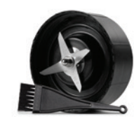
extractor blade with cleaning brush