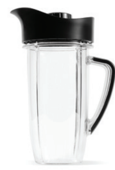
oversized cup with pitcher lid