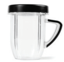
short cup with lip ring