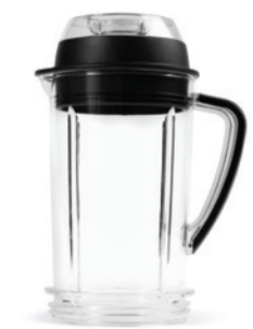
34 oz souperblast pitcher with 2-piece lid