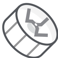
stainless steel cross blade