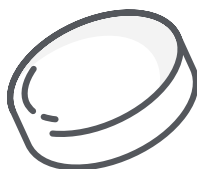
stay-fresh resealable lid